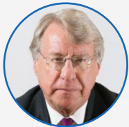
James Chanos Kynikos Associates