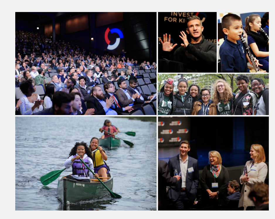
Our award from Invest For Kids is that rare and unique opportunity not only for Camp for All Kids to provide more Chicago youth with experiential outdoor learning, but to focus resources on putting structure, systems, and personnel in place to continue our growth trajectory. We are deeply grateful to Invest For Kids for their partnership in building our scale and capacity. 77

Through our grantmaking, Invest For Kids seeks to foster a rich ecosystem of organizations that lift up Chicago's most in-need youth from early childhood through college and career. Since our inception, the Invest For Kids community has collectively raised and donated more than $23 million.